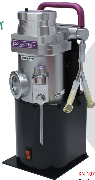
KN-1071-I For isoflurane