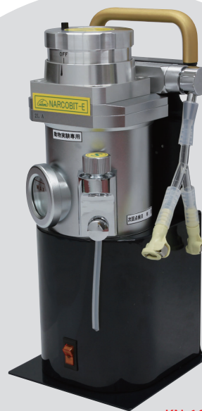
KN-1071-S For sevoflurane